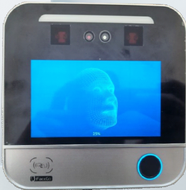
4.5" Touch Screen